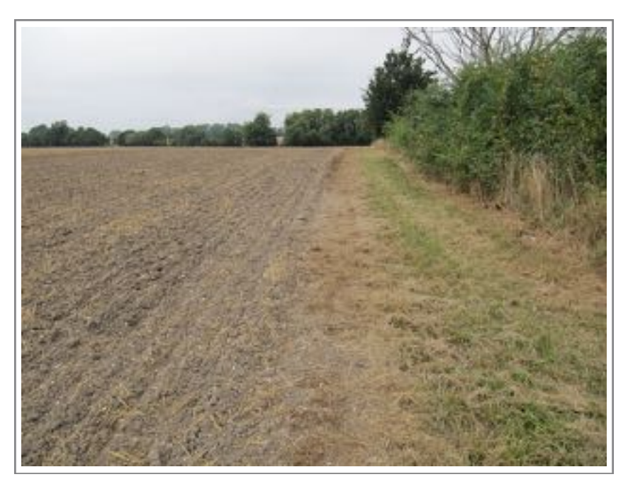
A local field after the harvest

Abington Pigotts + Guilden Morden Litlington + Steeple Morden Tadlow + Wendy